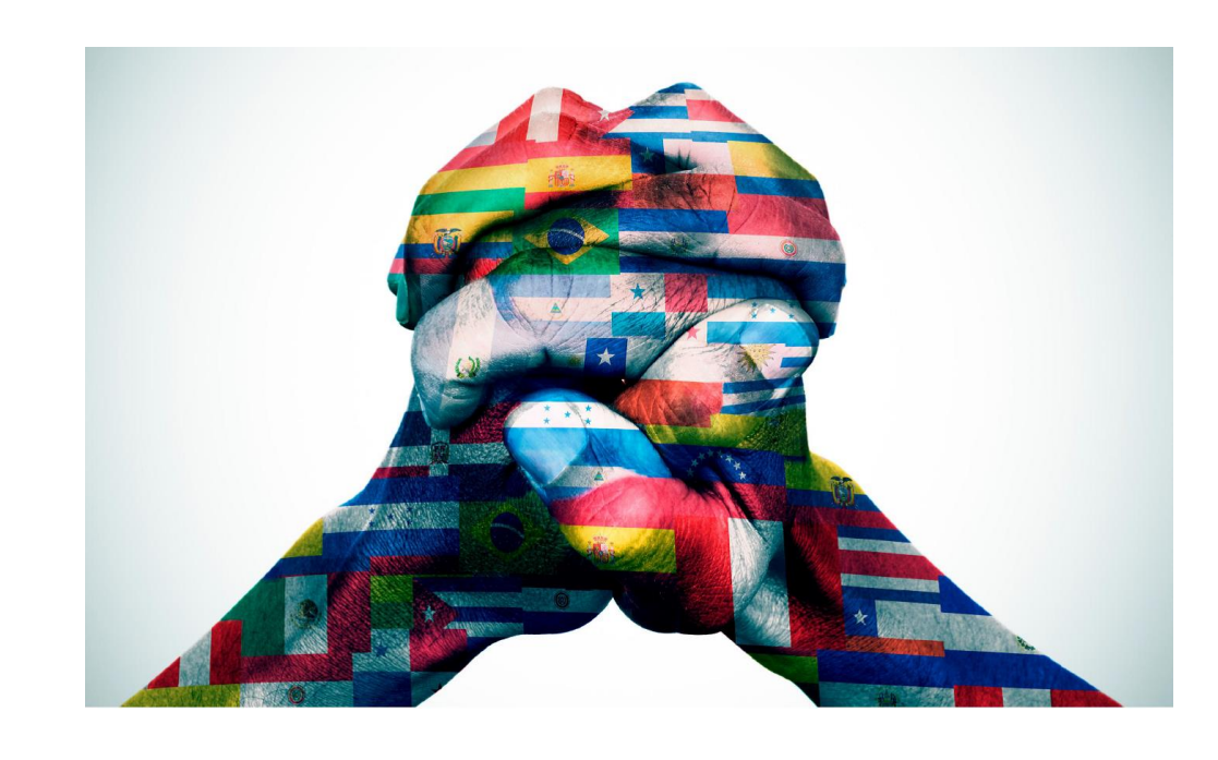
~Elisa Peña Zavala